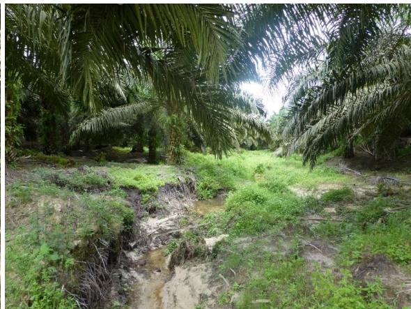
Image 3. Stream in sub-plot 23, in the lower part of the hill, where organic soils can be found (right)