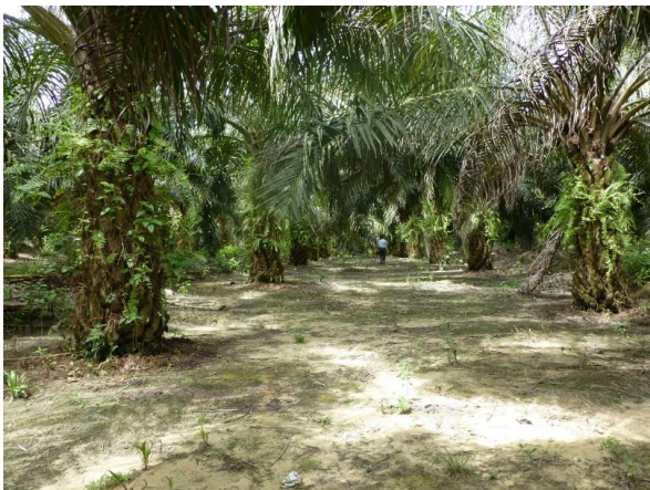
Image 2. Oil palms and mineral soils in the upper parts of the hills (left)