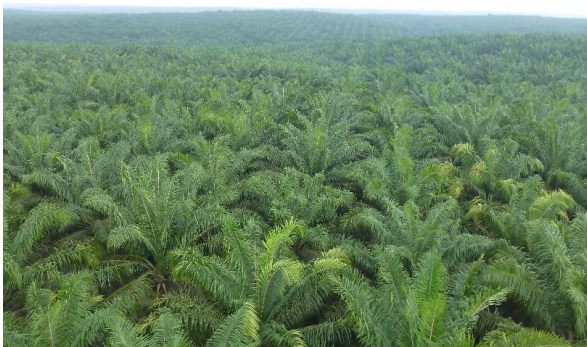
Image 4. View from the tower above the plantation